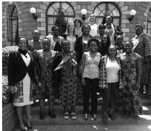
Members of the Ghana Association of University Women

She has also presented papers at IFUW and GWI conferences in Perth, Manchester, Mexico, Cape Town and Geneva on local concerns of Ghanaian women and how they were solved.